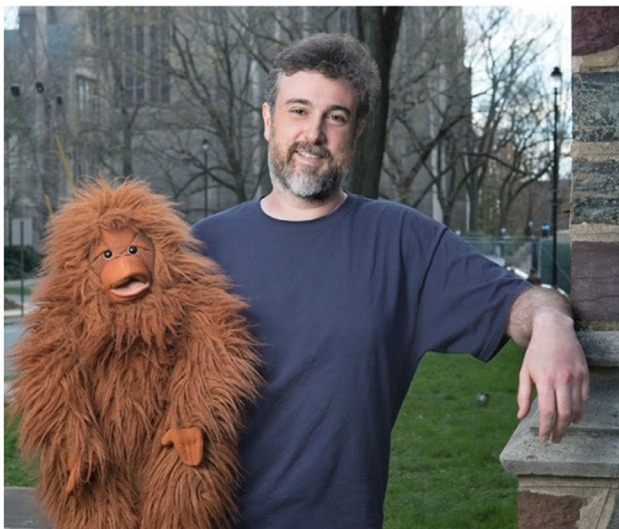
FIGURE 1 - Author on the left, dummy on the right.